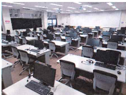
Computer suite at Bldg. C

* A pre-application is needed when you want to use the computer suite in Bldg. C for a club activity. Please submit the Request for Permission to Use on the website of the Center for ICT Education.